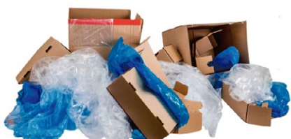
Waste from 10,000 die-cut lids..