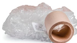
Waste from 25,000 Primoreels® lids

Primoreels A/S Skimmedevej 10 DK-4390 Vipperød Denmark