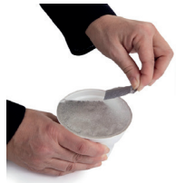
Traditional aluminum die cut lids often tear during opening.