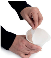
Primoreels® lids are easy to peel.

Smoother and glossier surface, improved printing quality and aesthetics of the lids.