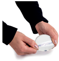
Primoreels® lids have a neat edge and are virtually non-tearable.